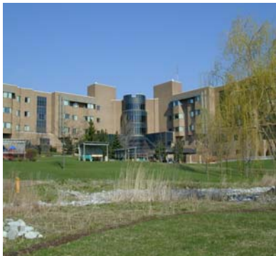
Parkwood Hospital St. Joseph's Health Care London